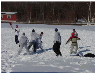
Don't miss out on the fun of

No matter what your skill level is, if you are interested in volunteering, please contact us at 800-294-2877 or email us