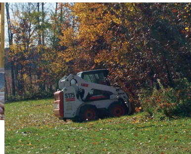
We got to use our 'new' ARC tree spade!