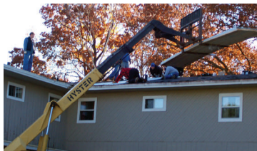
Good News Lodge received a new steel roof.