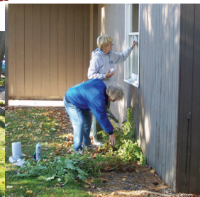
...and windows cleaned and painted