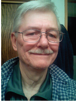
Happy to be in the quiet atmosphere of the ARC!