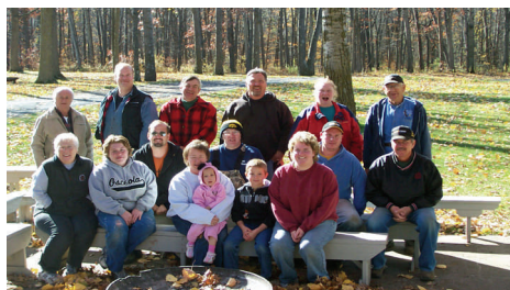
We had a FANTASTIC group of Volunteers for our Fall Family Weekend!