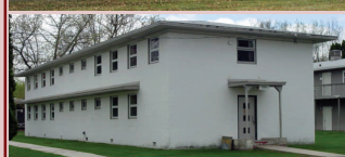
Daniel and Shunem Need New Roofs.