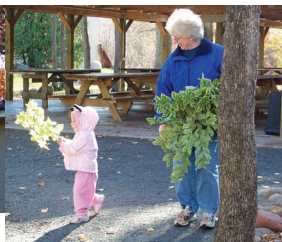
Everyone got in the act!