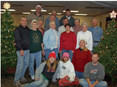
Merry Christmas From the ARC Staff!

If you no longer wish to receive the ARC-ives by mail please email us at arcregistration@centurytel.net or call 800-294-2877.