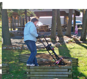
Flower Beds were prepared for winter...